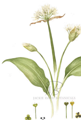
Painting in watercolour