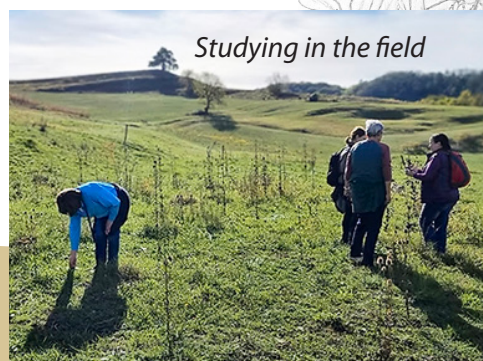
Studying in the field